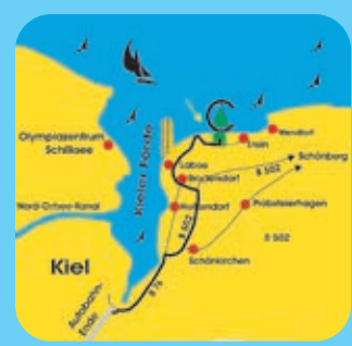
GPS Koordinaten: 54°24'50N; 10°14'49E